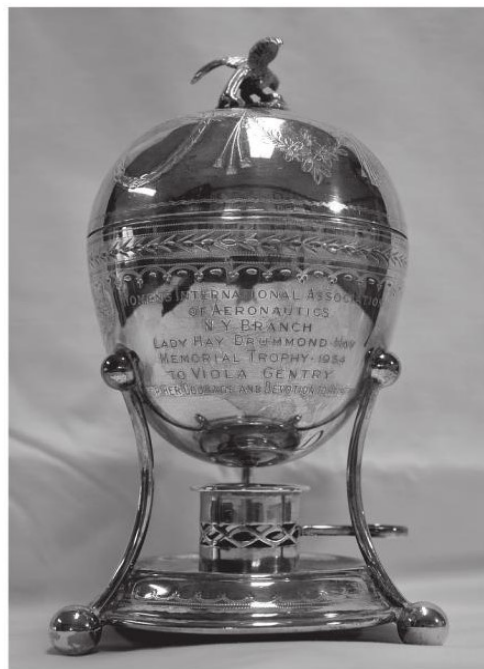
Fig. 1: Lady Grace Drummond-Hay / Jesse R. Chamberlain Memorial Trophy