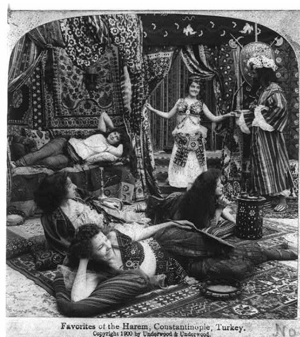
Fig. 4: Favorites of the Harem, Constantinople (ca. 1900).

However, having entered the ordinarily inaccessible rooms, similarly to Leslie, Le Plongeon, and Nuttall, Drummond-Hay uses the expression of the picturesque in a contracted form, e.g. when she describes the interior of a harem in Morocco: “Le décor est presque toujours d’un pittoresque romantique.” 227 The visual representations of harems function similarly to the picturesque house that, according to John Conron, is a sphere dialogically defined by both genders: a mental map, often as surreal as apartheid, of spaces, functions, powers, and responsibilities both divided, often hierarchically, and shared by gender. 228 Drummond-Hay describes this gender-specific layout in detail: “At the extreme end of this courtyard another door in the high walls leads to the garden reserved for members of the hareem, who were disporting and sunning themselves on the drab lawns, while innumerable children played games around the shabby bushes.” 229