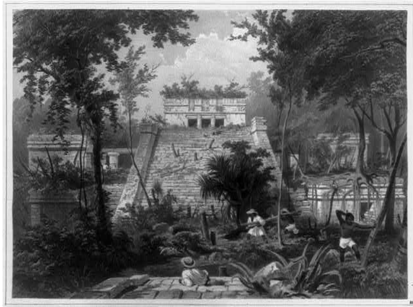
Fig. 3: Scene of ancient Mayan Indian monument in the Yucatan Peninsula of Mexico (1844).

Preston parallels Stephens' vision to the American painter Thomas Cole, who was a painter known for employing the picturesque aesthetics. 102 Although Preston reasons that Stephens and Catherwood depart from the imagery of Waldeck that was rooted in an artistic style and move to a more scientific approach, both Stephens and Catherwood, as Preston himself, cannot distance themselves from the aesthetic principles that govern the picturesque. Preston cannot resist describing Catherwood's intricately constructed romanticized images, in particular the folded panoramic view of Uxmal nearly a yard long that cascades out of Incidents of Travel in Yucatán like a handkerchief, 103 in picturesque aesthetic (see fig. 3):