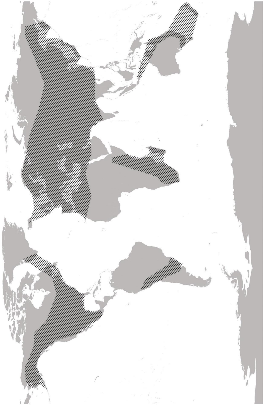
Fig. 10 Chara globularis