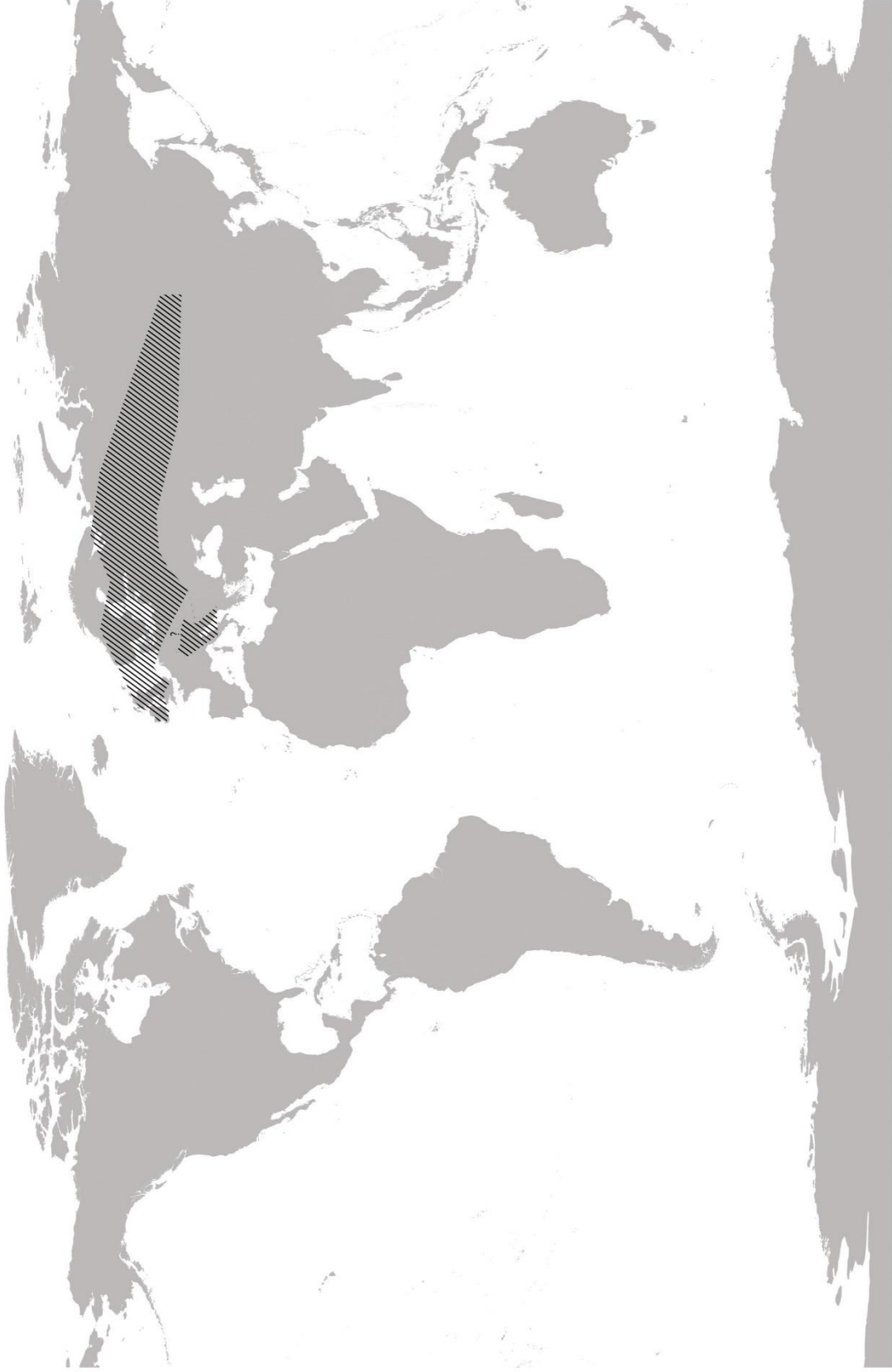
Fig. 15 Chara subspinosa