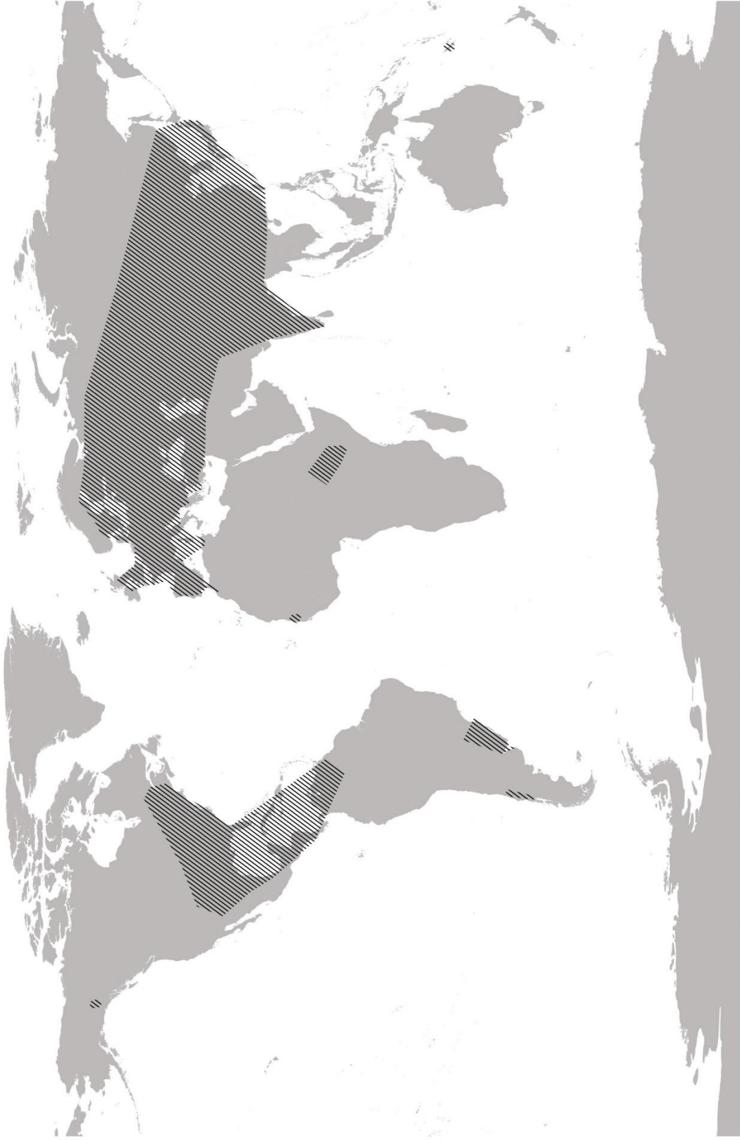
Fig. 25 Nitella gracilis