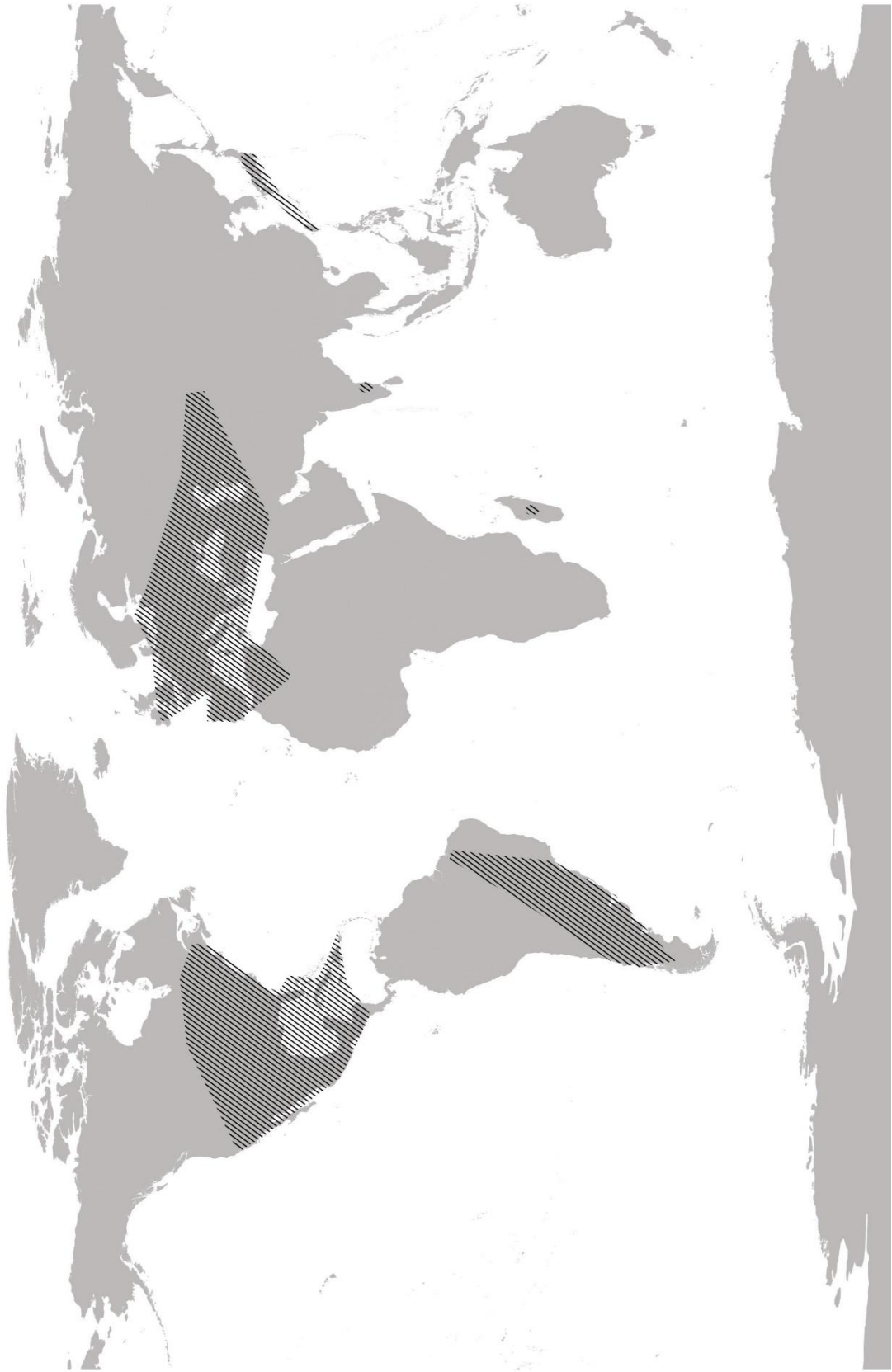
Fig. 30 Nitella tenuissima