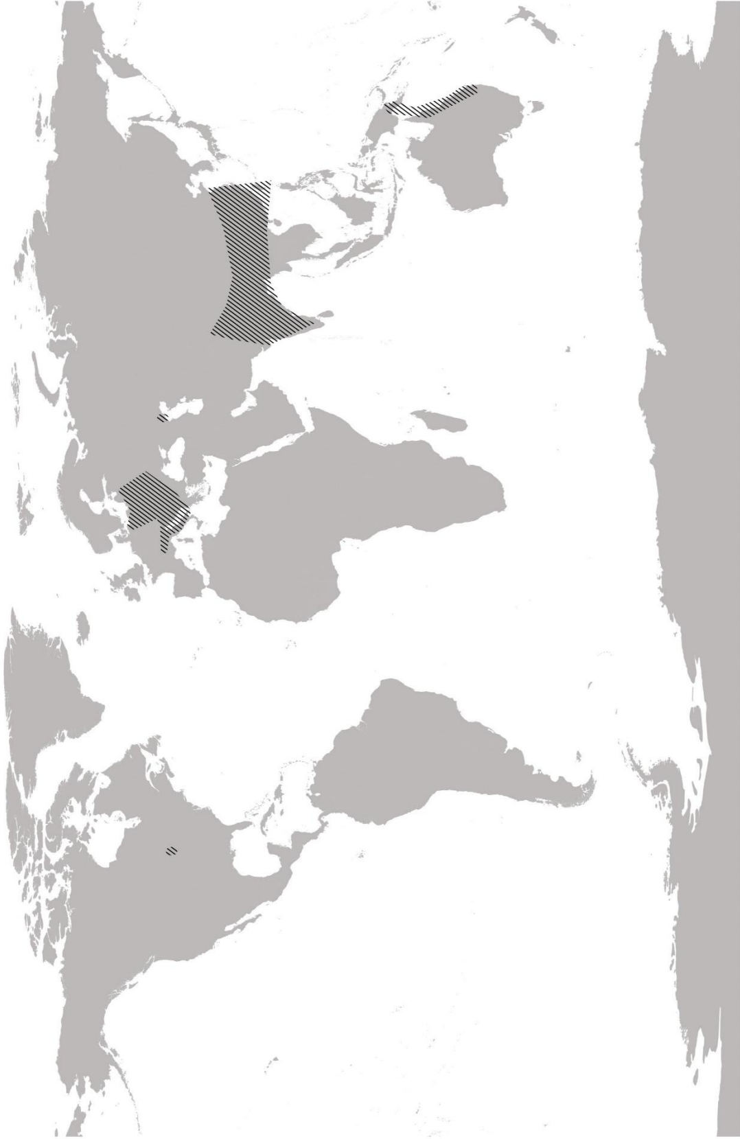
Fig. 21 Lychnothamnus barbatus