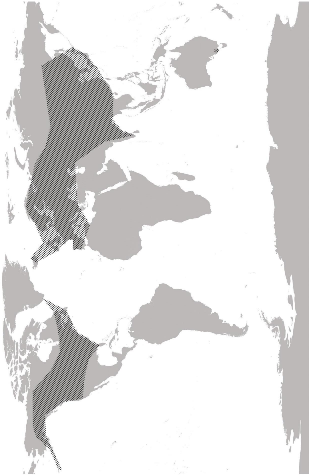
Fig. 18 Chara virgata