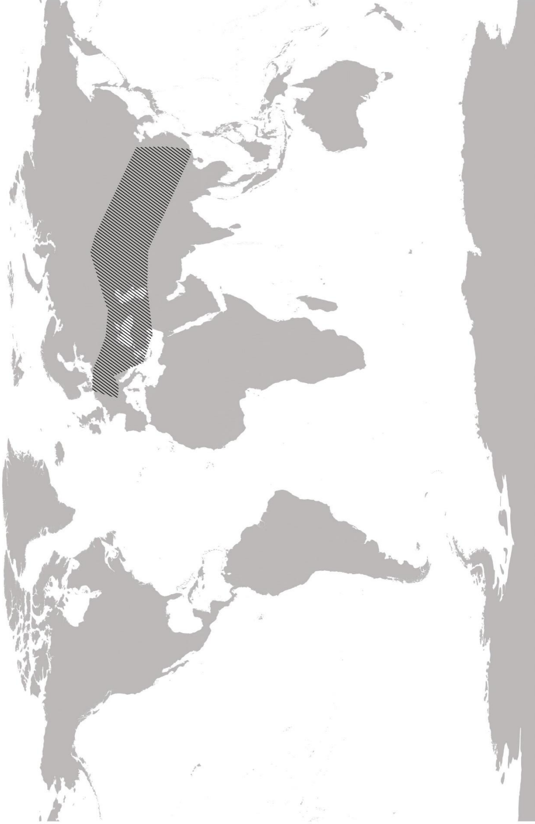
Fig. 16 Chara tenuispina