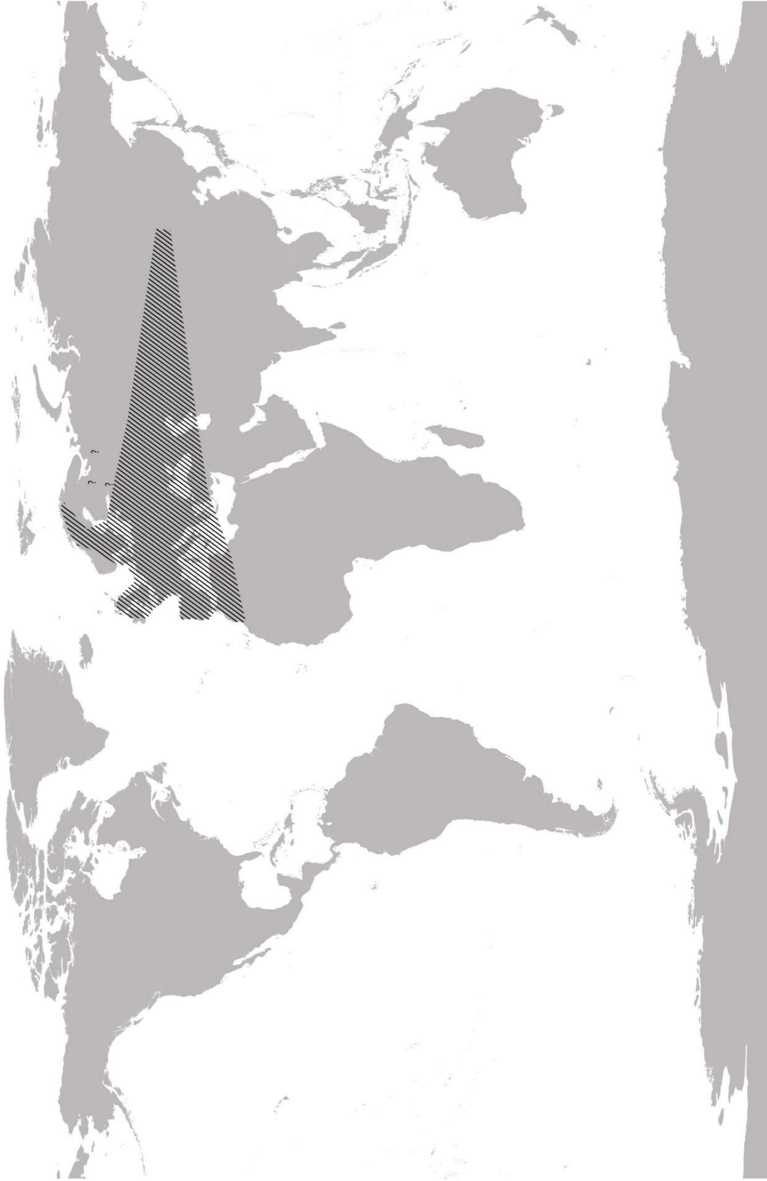
Fig. 11 Chara hispida