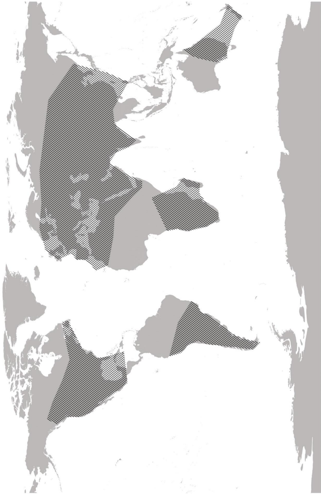
Fig. 19 Chara vulgaris