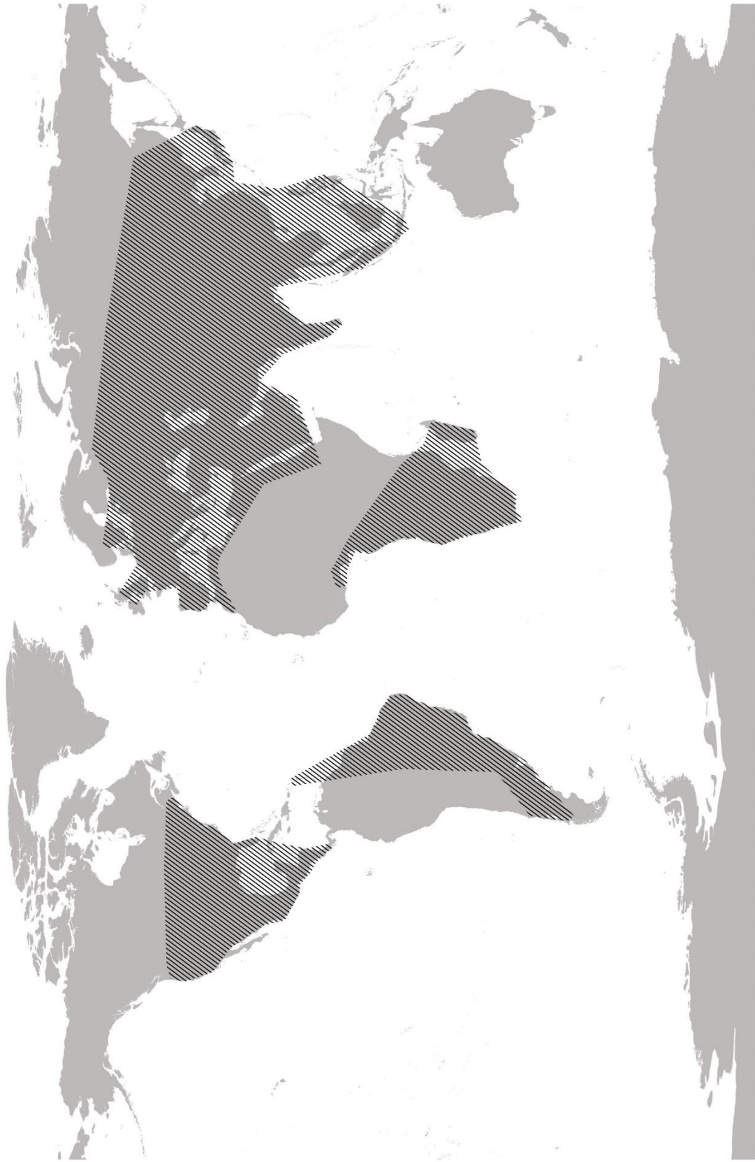
Fig. 27 Nitella mucronata