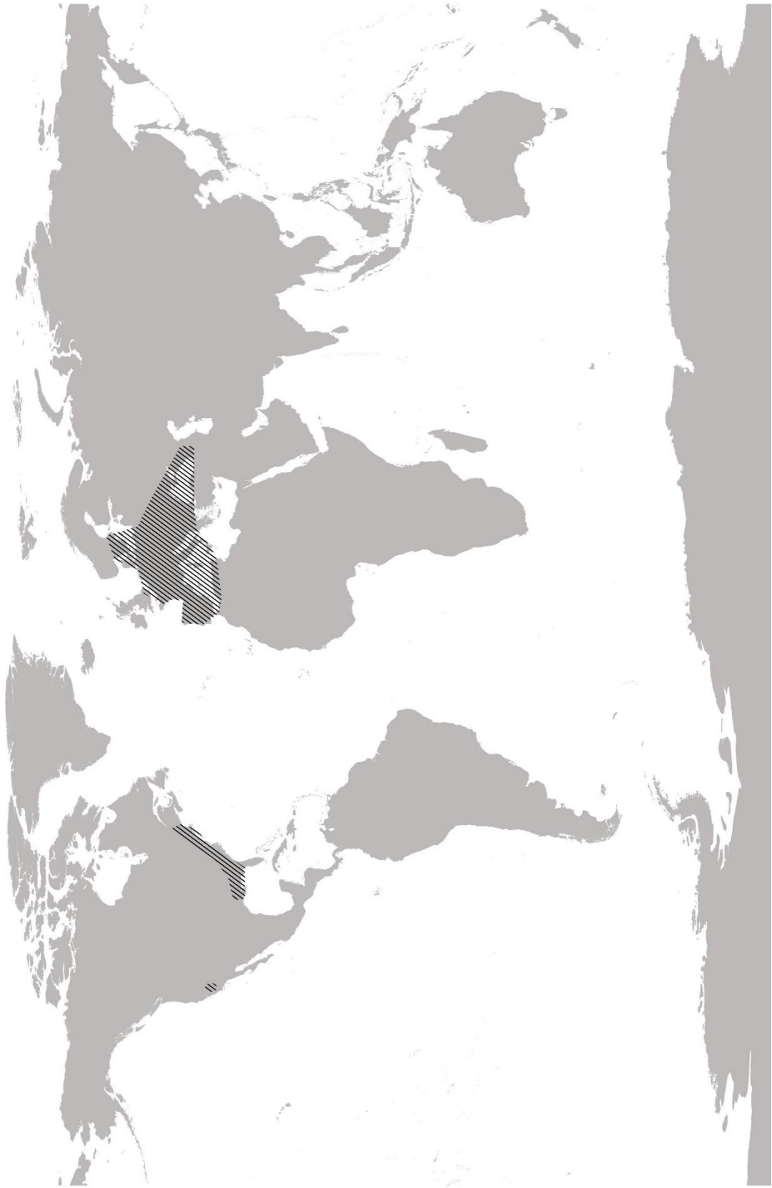
Fig. 22 Nitella capillaris