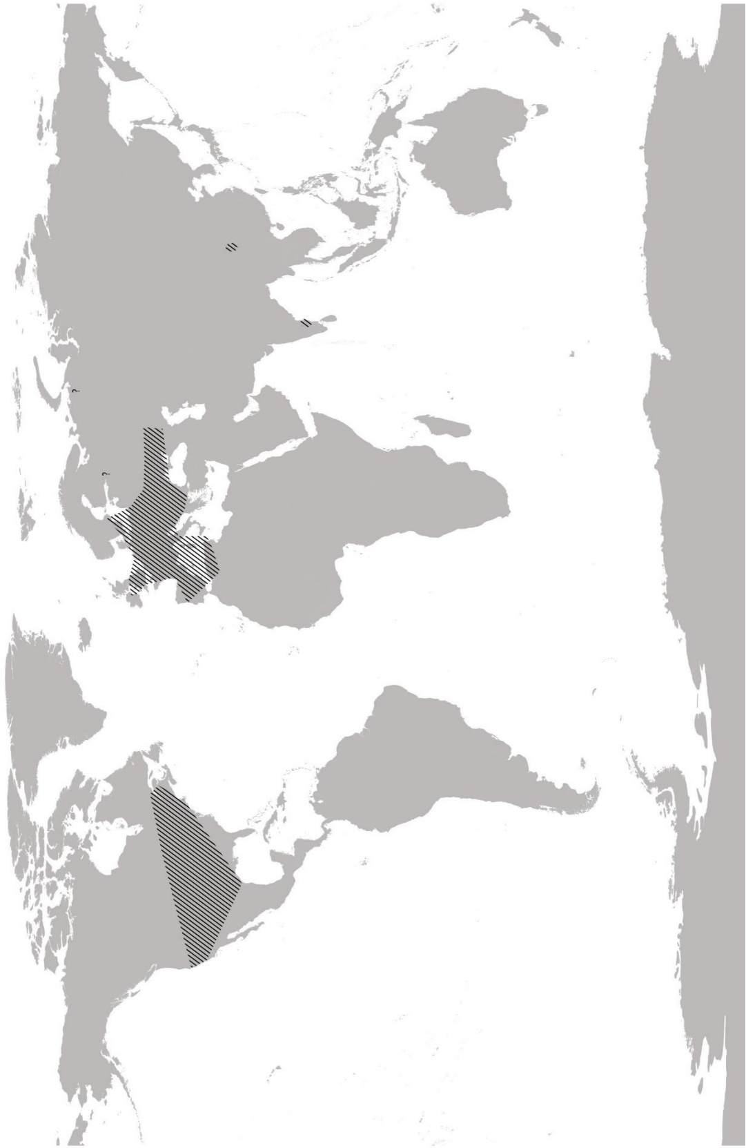
Fig. 34 Toypella intricata