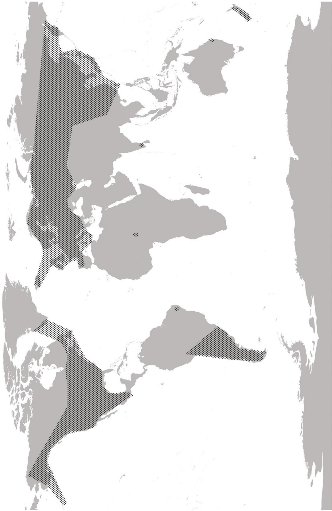
Fig. 24 Nitella flexilis