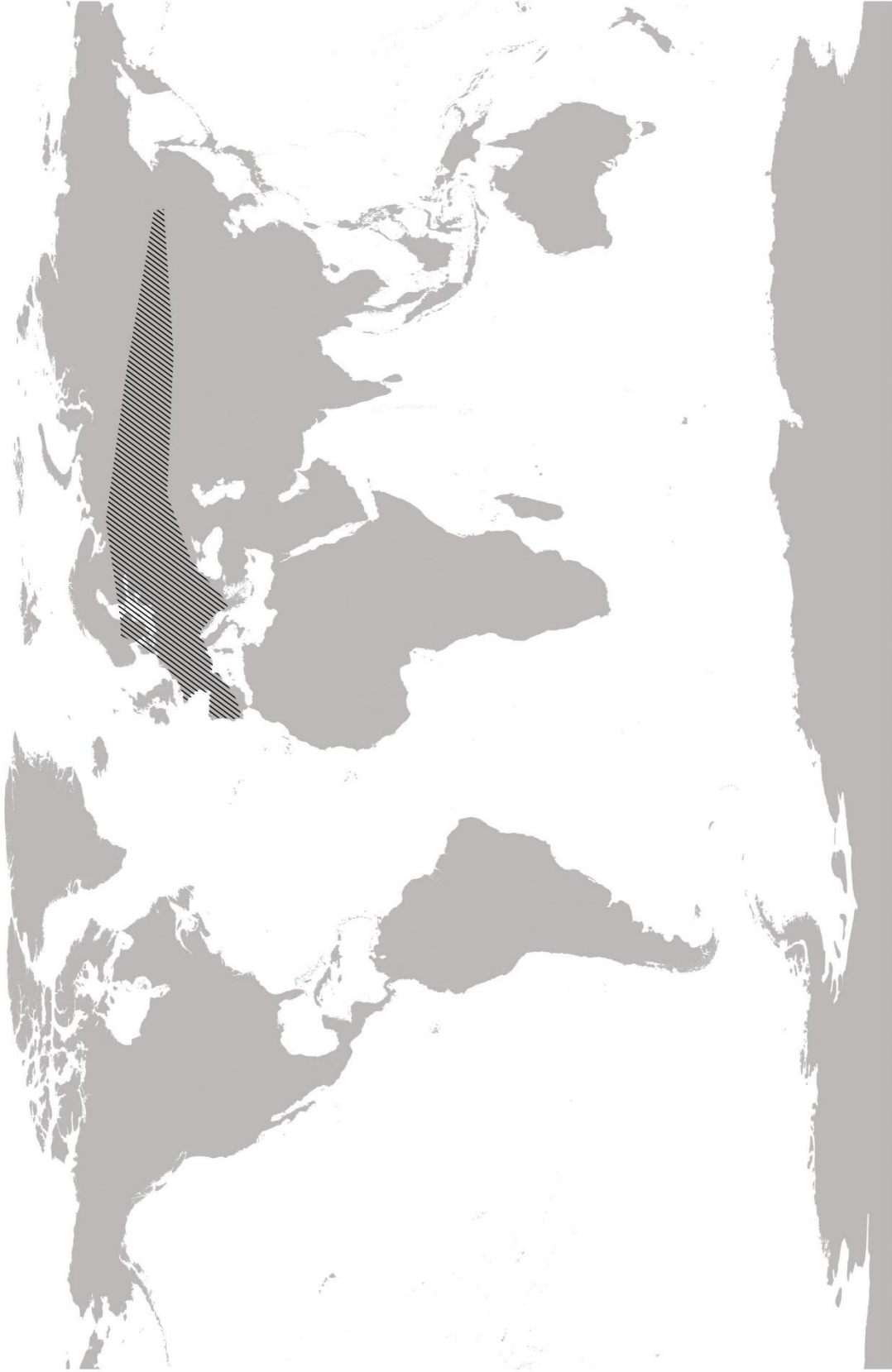
Fig. 29 Nitella syncarpa