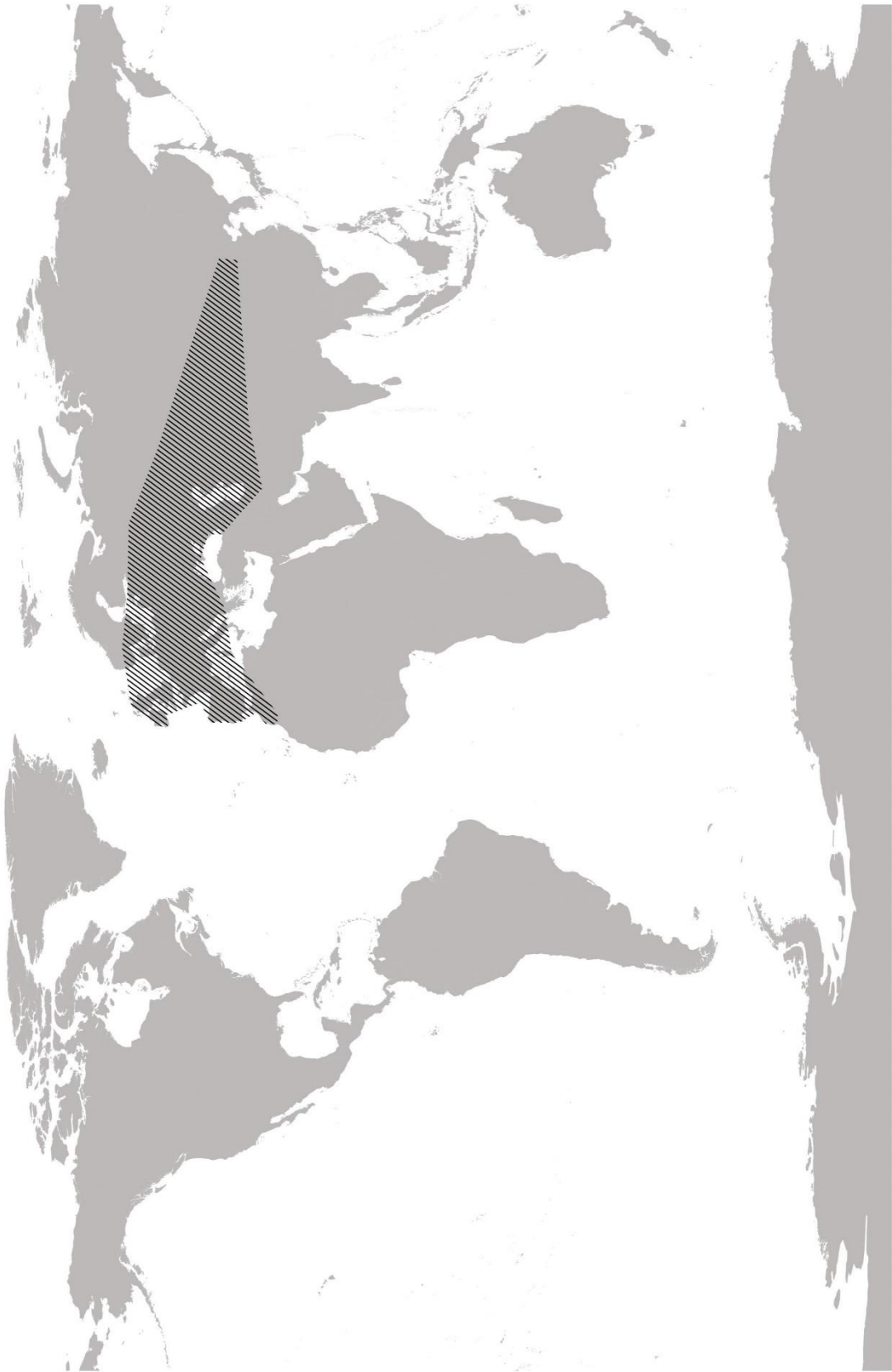
Fig. 1 Chara aculeolata

The range areas are shown with stripes and without surrounding shape-lines to reflect the uncertainty of the borders.