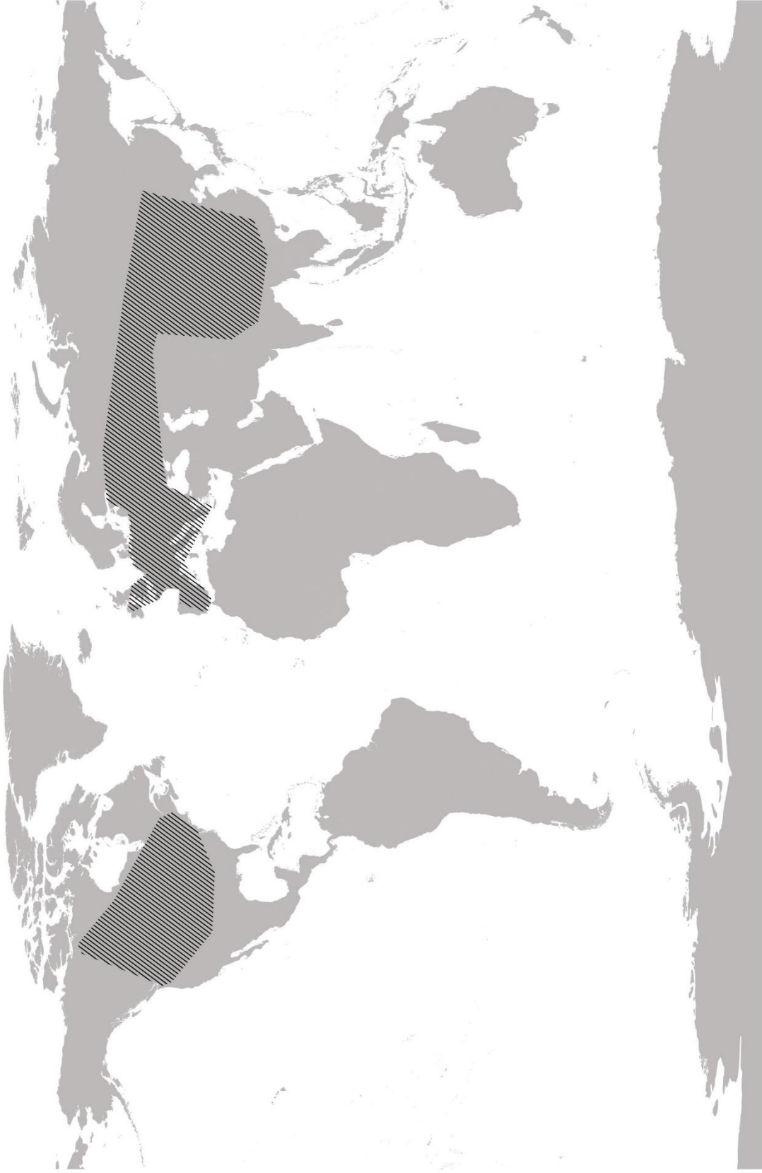
Fig. 36 Tolypella prolifera