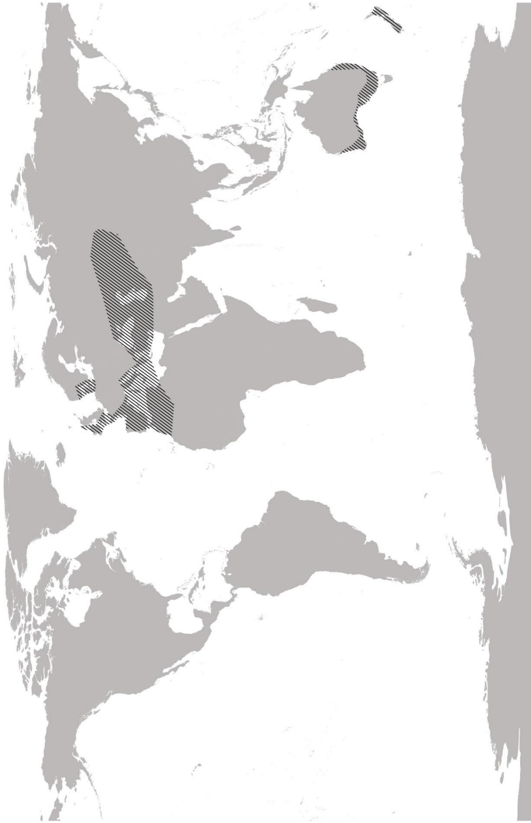
Fig. 20 Lamprothamnium papulosum