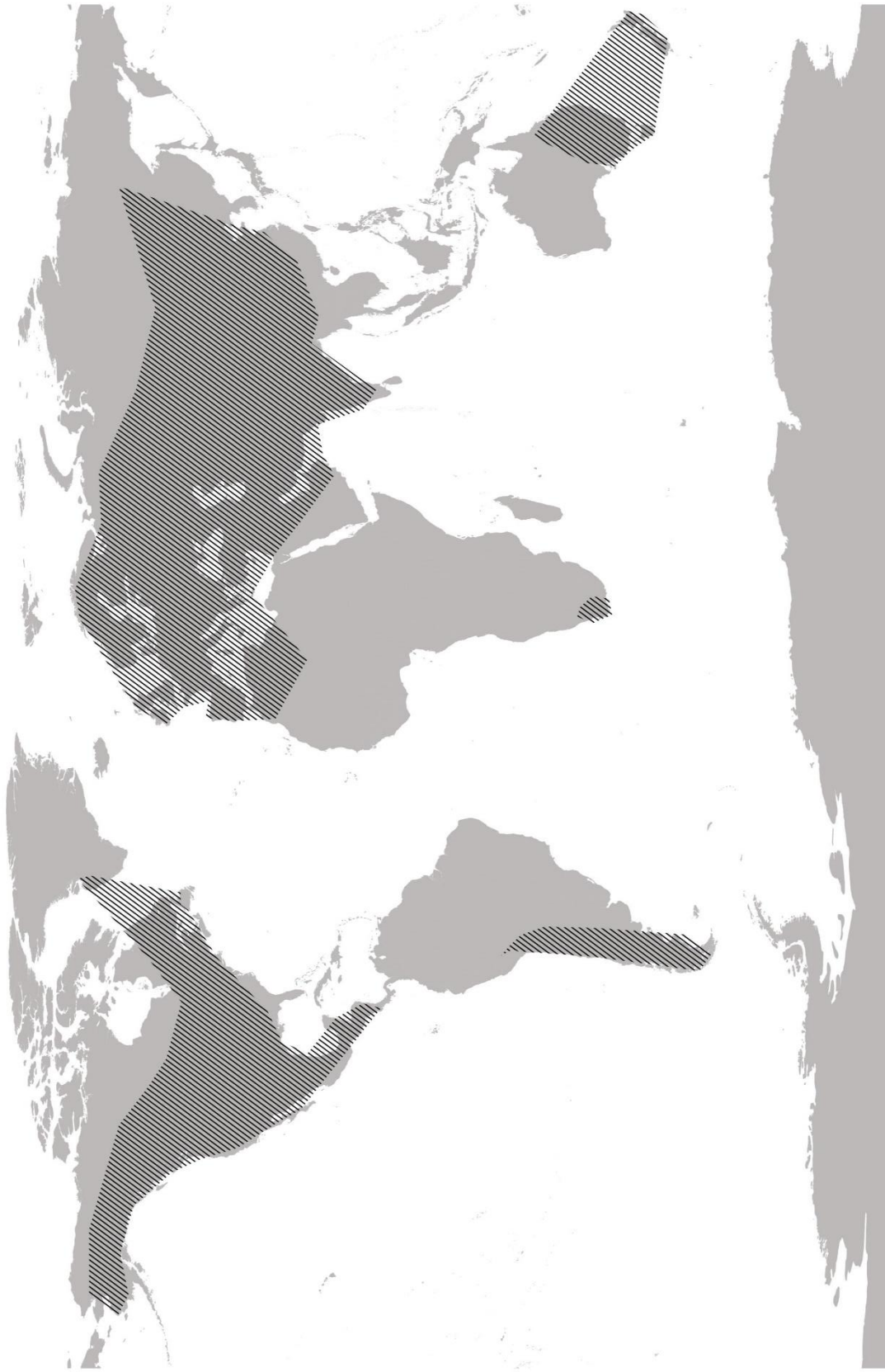
Fig. 8 Chara contraria