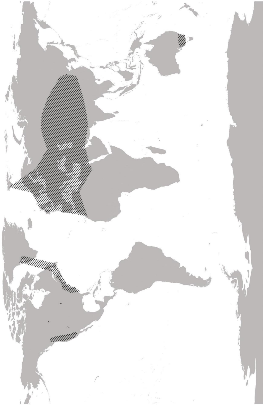
Fig. 6 Chara canescens