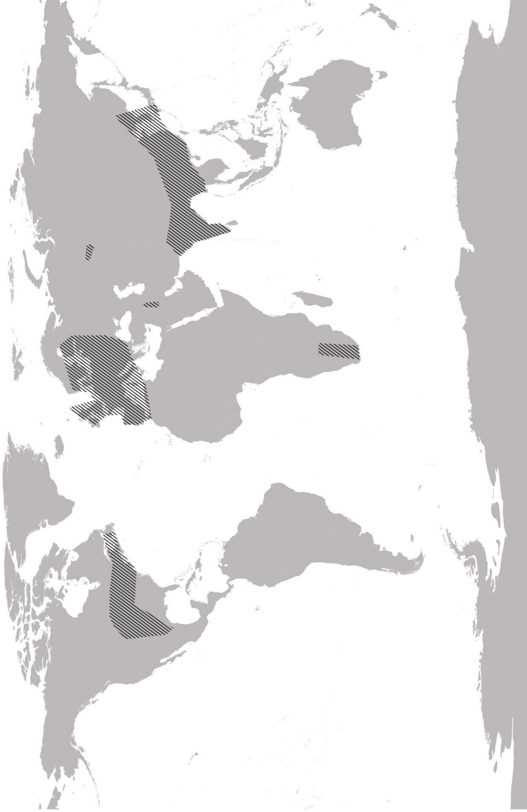
Fig. 23 Nitella confervacea