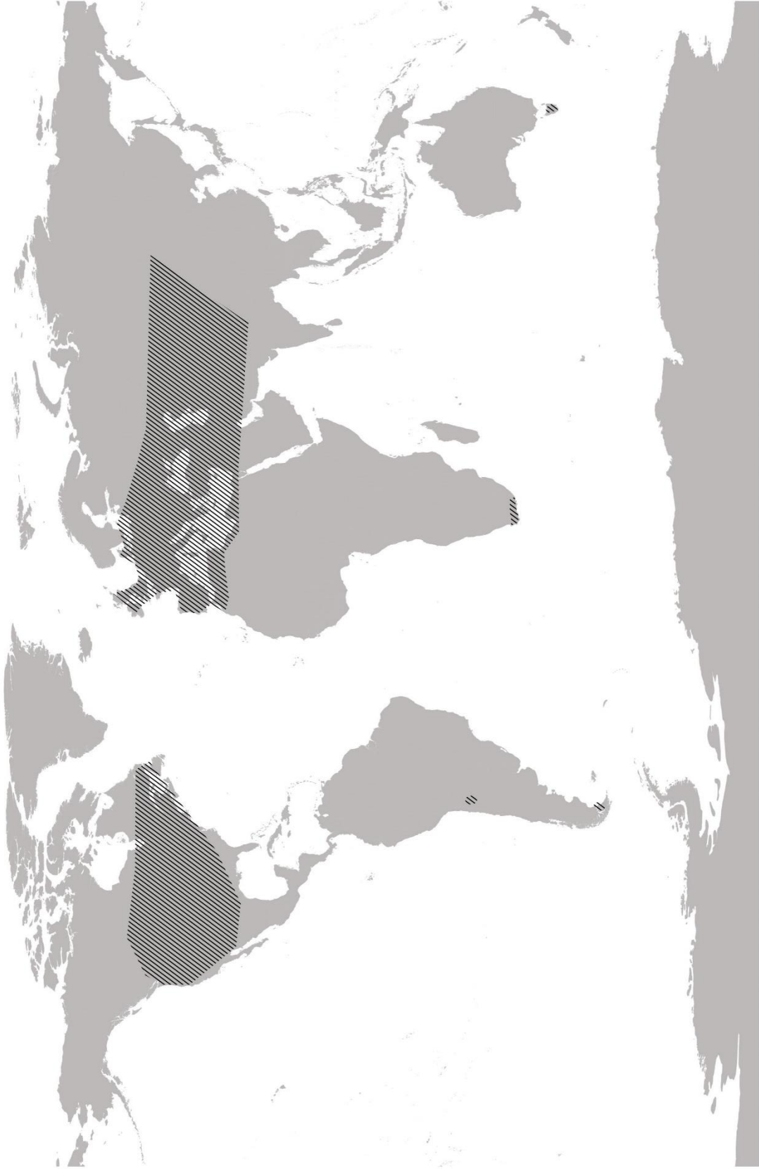
Fig. 33 Tolypella glomerata