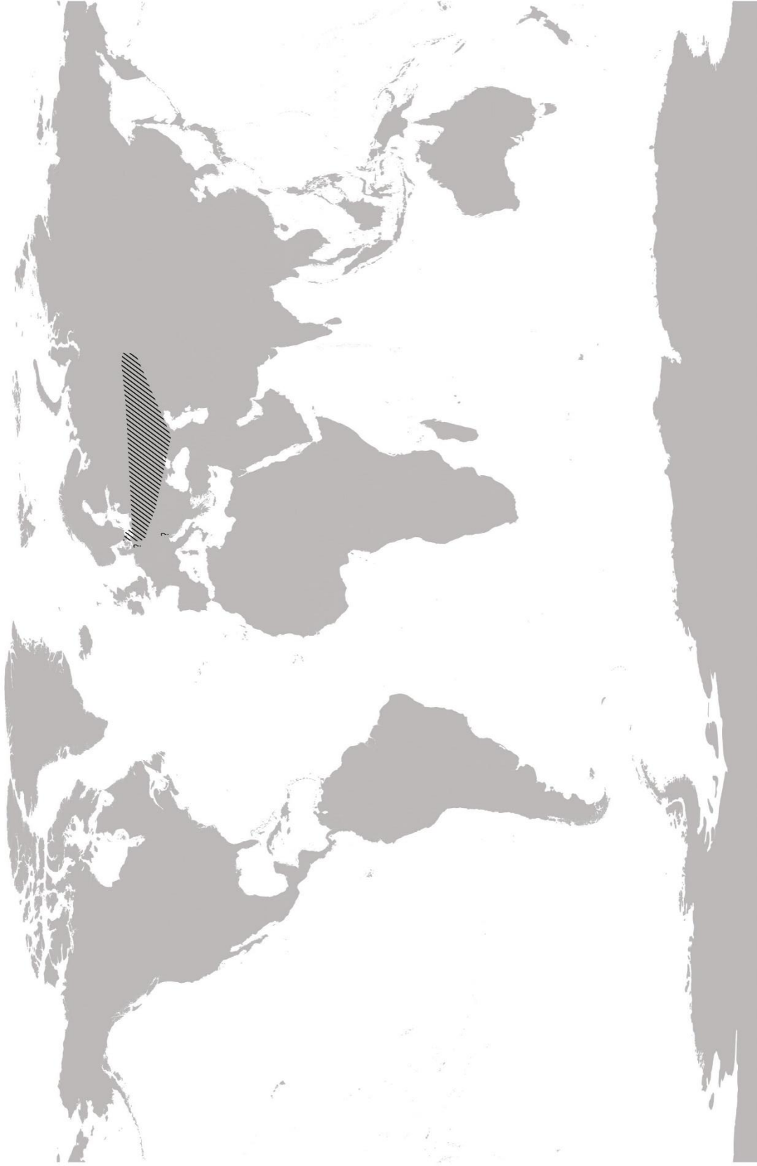
Fig. 4 Chara baueri