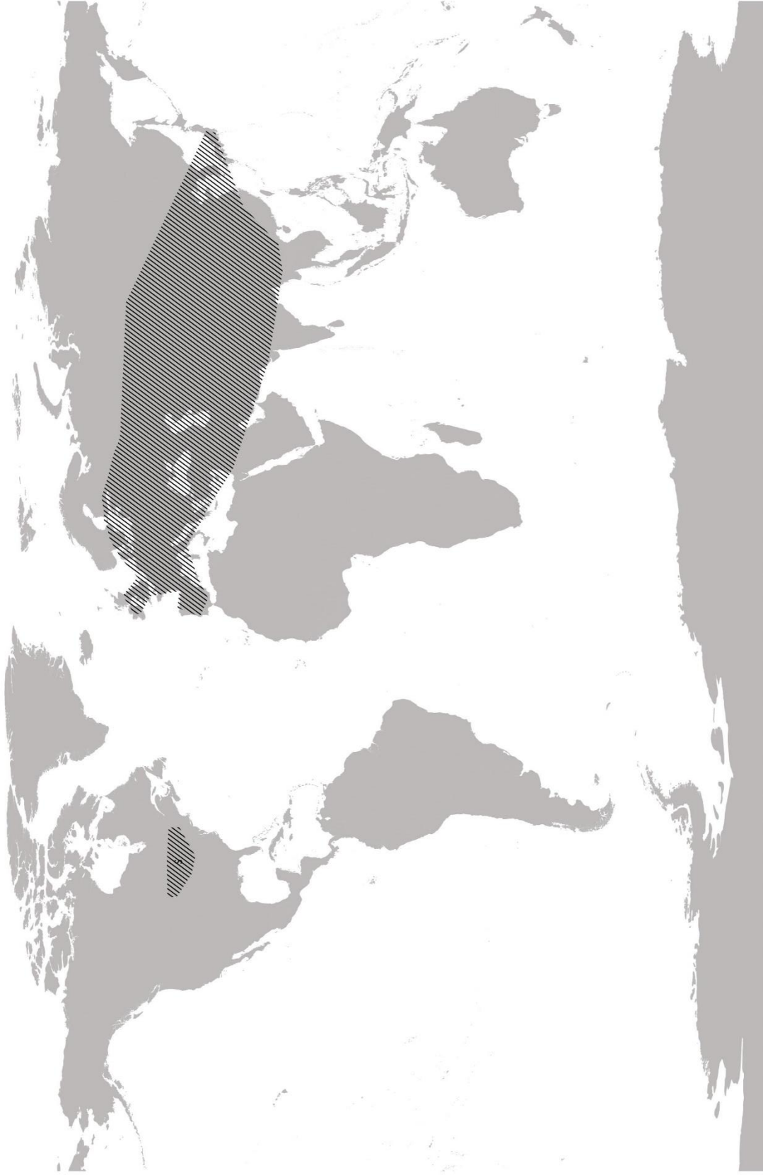
Fig. 32 Nitellopsis obtusa