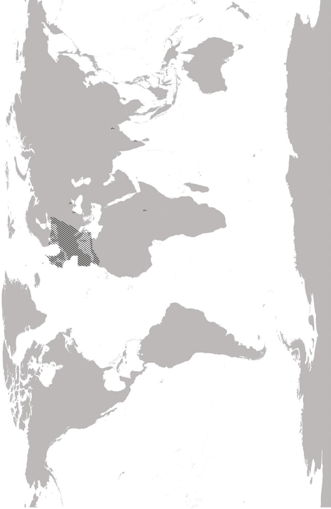
Fig. 31 Nitella translucens