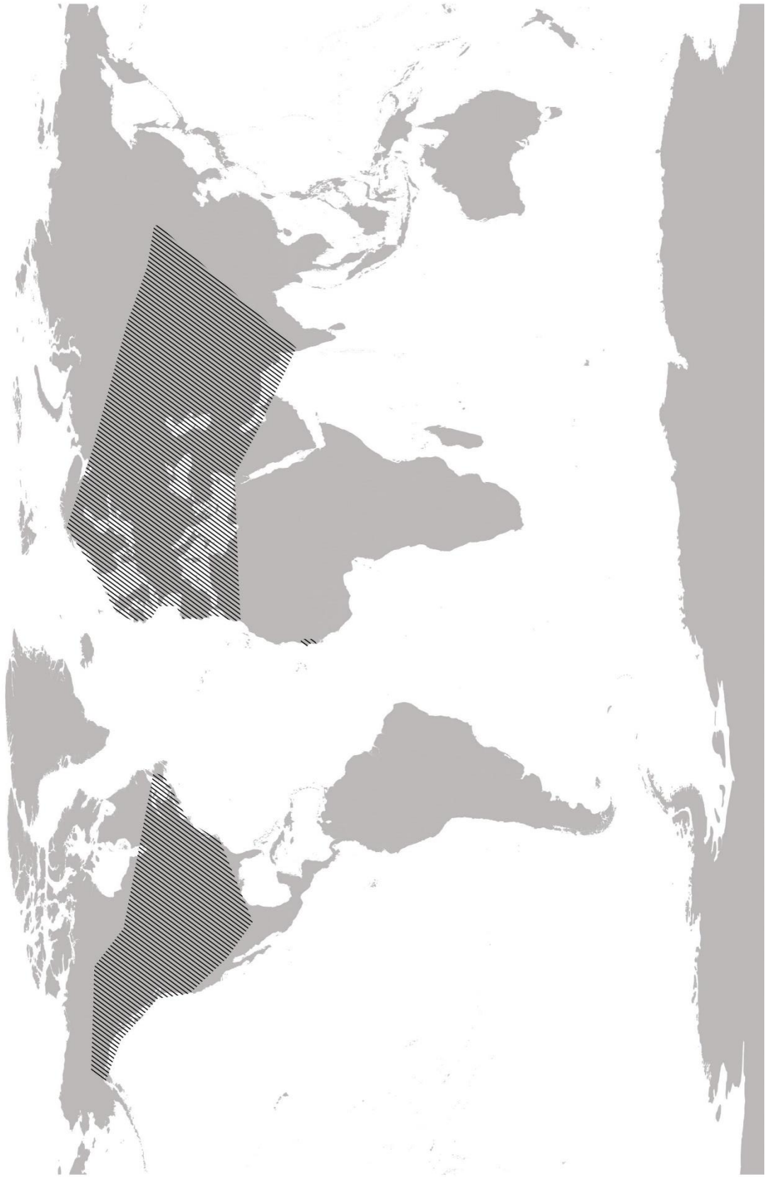
Fig. 2 Chara aspera