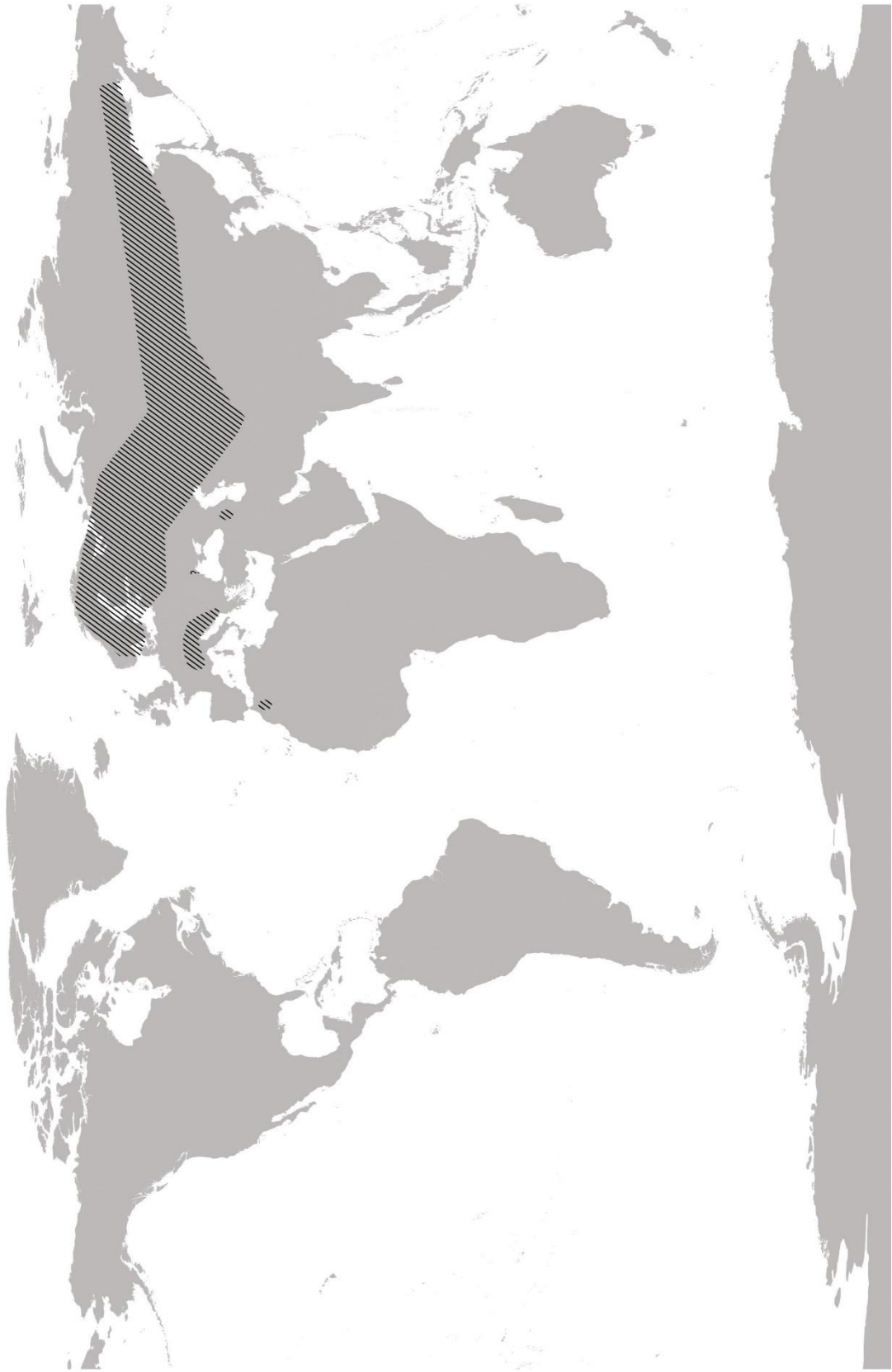
Fig. 14 Chara strigosa