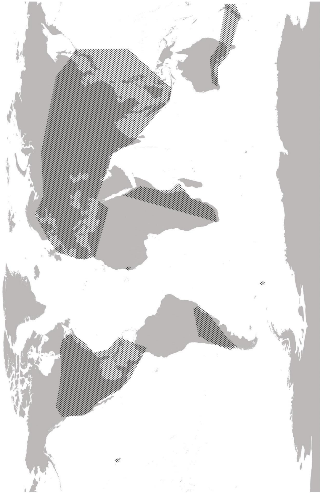
Fig. 5 Chara braunii