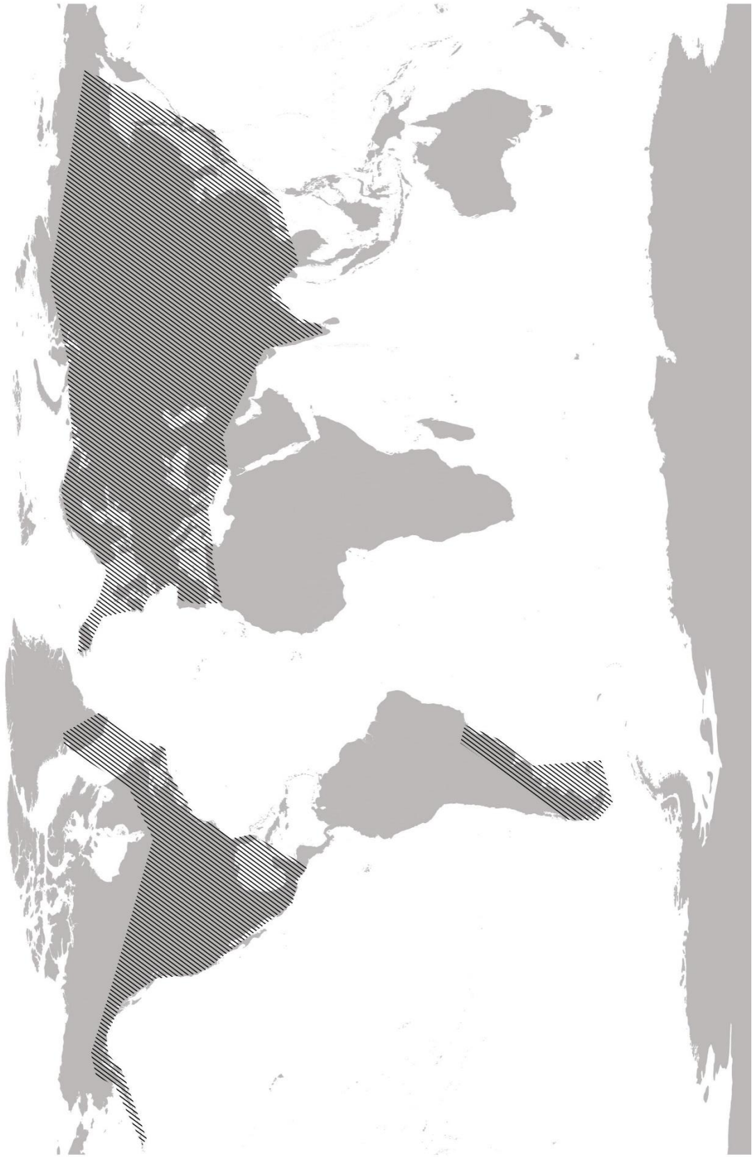
Fig. 28 Nitella opaca