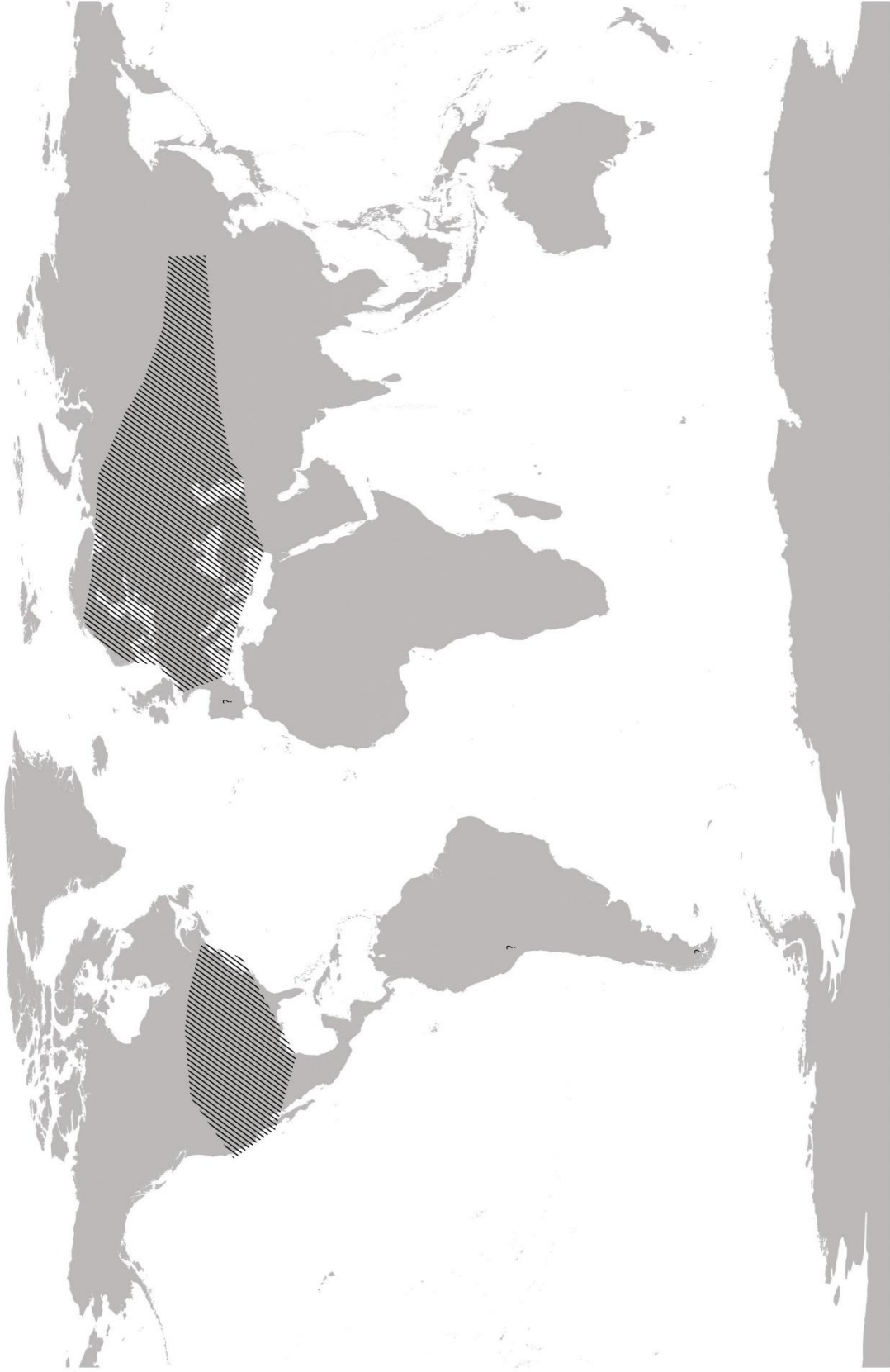
Fig. 13 Chara papillosa