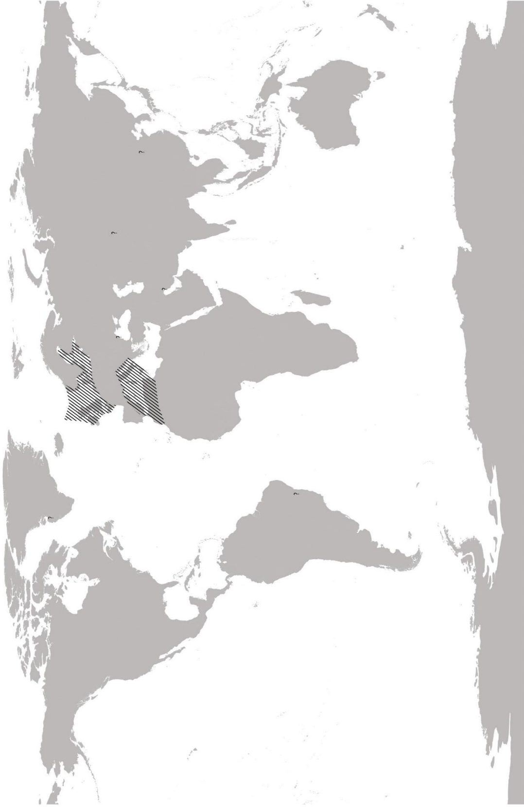
Fig. 3 Chara baltica