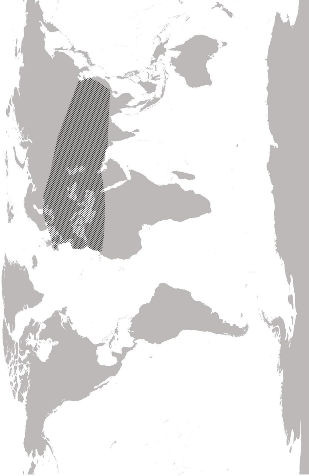
Fig. 7 Chara connivens