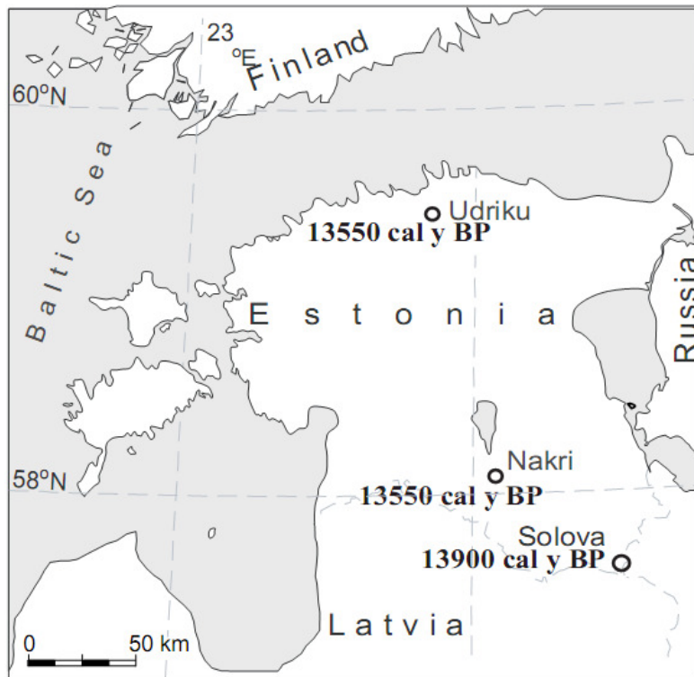
Fig. 1 The location of the study sites indicating the age of the first postglacial find of Characeae oospore.

(Birks 2000). The counts of oospores were re-calculated to oospore presentation in 100 cm 3 to ease the comparison between reasearch localities (Fig. 2).