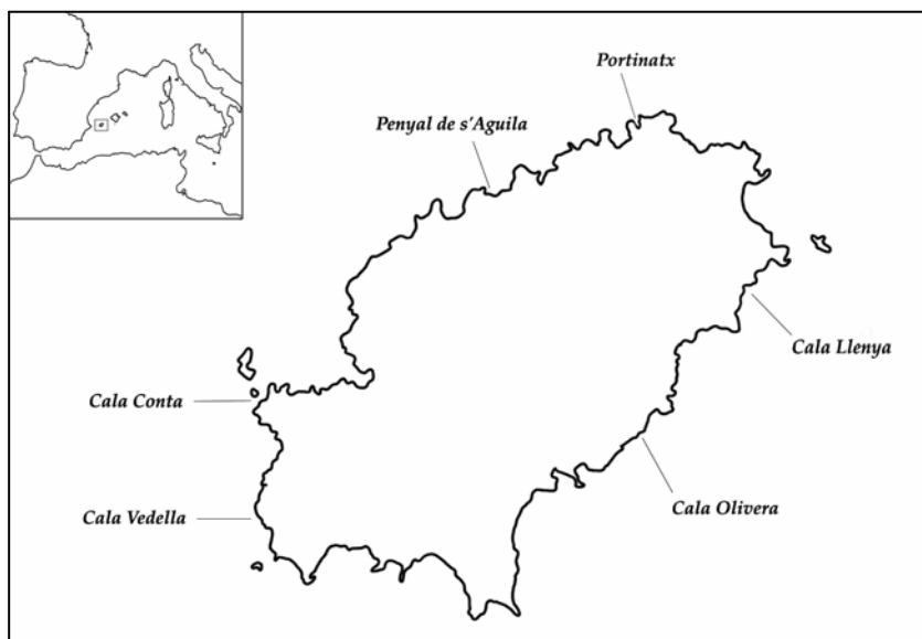
Fig.1 Investigated areas of the island of Ibiza

Between 1998 and 2007 we conducted annual studies by visual census in the months of March and April, complemented by additional studies in the months of September and October as well as by occasional sightings by two of the authors (R.A.P. and C.H.G.M.) going back to 1980. The main studies took place at six locations around Ibiza (Fig. 1), and a few additional places were investigated at irregular intervals (Cala Nova, Cala Boix, Cala Mastella, Cala Bassa, Cala Tarida). The observations were made while snorkelling in shallow areas or scuba-diving in deeper regions down to 40 m. In order to also gather nocturnal species or species only active during dusk and dawn, we made several night dives between 10 p.m. and 1 a.m. in the Cala Llenya, where all relevant substrates could be checked for demersal fishes. In order to properly identify taxonomically delicate species (e.g. Gobiidae, Blenniidae, Gobiesocidae) some fishes were caught with hand nets and determined in the lab. Several specimens were fixed in formaldehyde (5 to 10 %) and then transferred into alcohol (70 %). They are stored in the 'Senckenberg Museum' (Frankfurt), in the 'Naturhistorisches Museum' (Vienna) and in the 'Zoologische Staatssammlung' (Munich). The taxonomy and scientific names of fish were taken from PATZNER & MOOSLEITNER (2003) and FROESE & PAULY (2006).